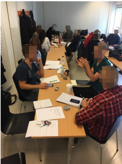
Figure 2. Student teachers discussing their drafts in the seminar group of Study II. The chair in the lower left corner of the picture is that of the researcher.

The work during the bachelor thesis course was divided between working with the whole group of students and working in separate smaller groups. When all students were together, they often discussed methodological issues that the tutor had identified as relevant for all of them. At times, they separated into smaller groups inside the larger seminar room (see figure 2).