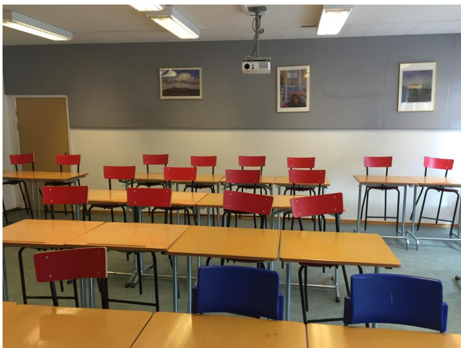
Figure 3. The classroom space, as seen from the front desk